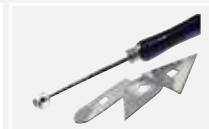
Scraper set 119.178