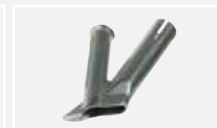
Speed welding nozzle Ø 5 mm 125.315