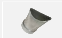
Glass protection nozzle