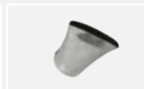
Wide slot nozzle